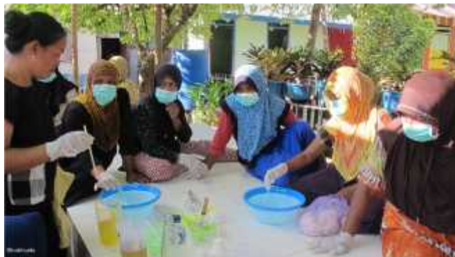
Figure 2 (Reef Check Indonesia Foundation)

materials and how to process it. The people from Reef Check Indonesia Foundation, mostly are female who help to develop the soap group. The picture below is one of the example.