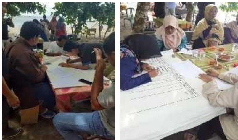
Figure 3. Asset Collection through FGD with Balbar Community

The service team conducts asset collection through FGD.