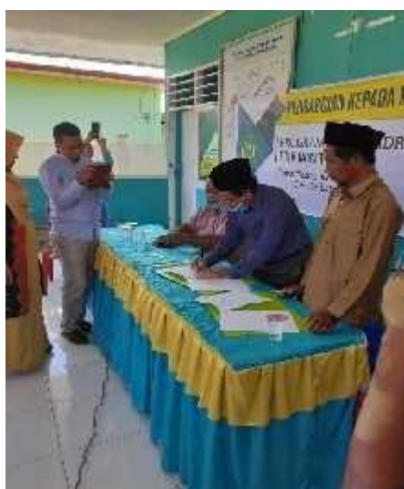
Figure 2. Mou signing by PkM Team and Balbar Headmaster after signed the MoU

The first step in ABCD-based PkM activities is to coordinate and establish Balbar Village as a target village through the signing of the MoU by the Community Service Team and the Headman of Balbar.